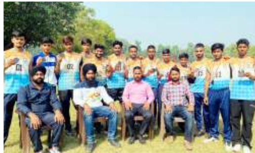
Bronze Medal in Kho-Kho in P.U. Division-A Kho-Kho Championship