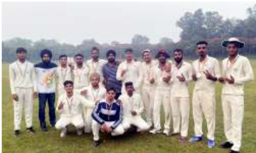
Silver Medal in Cricket in P.U. Division-B Cricket Championship