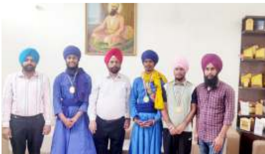
Gold Medal in P.U. Inter College Gatka Championship