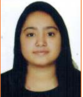
Lavisha BA-II 82.5%