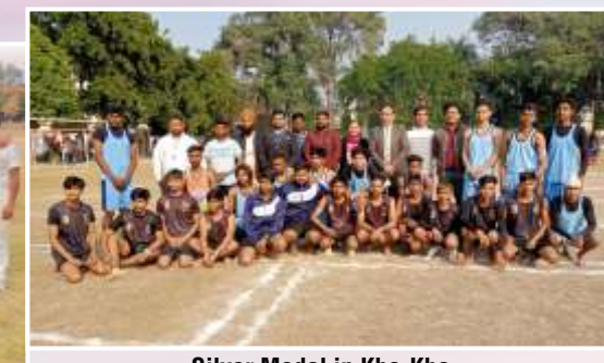
Silver Medal in Kho-Kho in P.U. Division-A Kho-Kho Tournament