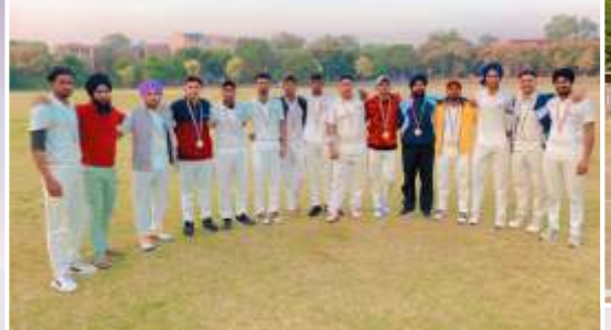
Gold Medal in Cricket in P.U. Division-B Cricket Tournament